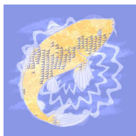
Generative patterns NISHIKIGOI