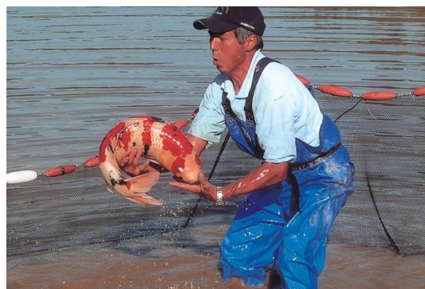
Nishikigoi (coloured carp)

Nishikigoi NFTs (Non-Fungible Tokens) (tokens also serve as e-resident cards of the Yamakoshi area), the motifs of which are coloured carps originated in Yamakoshi, are issued to gather people, funds and wisdom from all over the world, enabling the formation of the "Yamakoshi DAO" (Decentralised