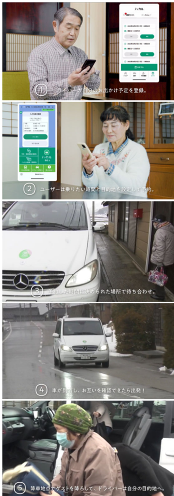
Photos: Images of Noccacal Asahimachi in operation