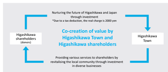
Shareholder system diagram