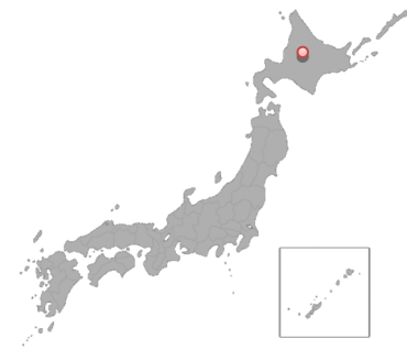
Higashikawa Town, Hokkaido