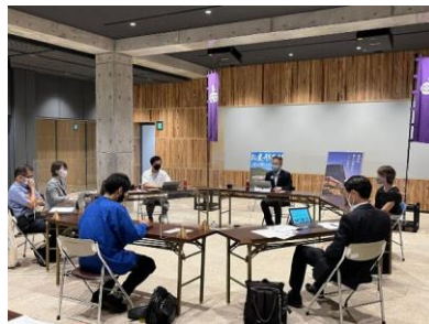
Policy design meeting