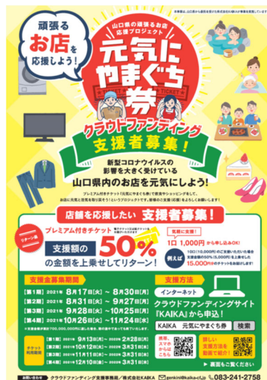
Flier recruiting supporters