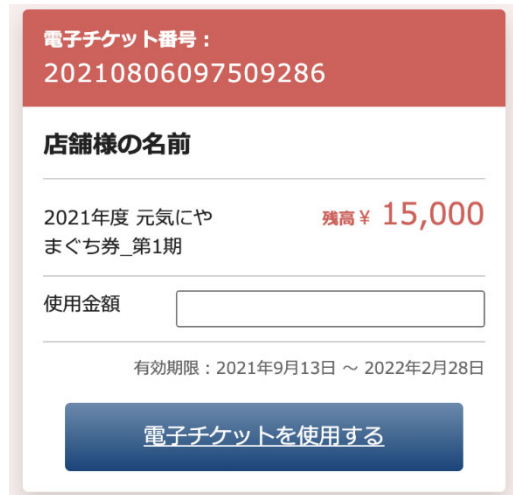
Electronic voucher screen for inputting amount to be used